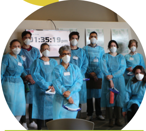
AFC's team of COVID-19 Vaccine Clinic volunteers.