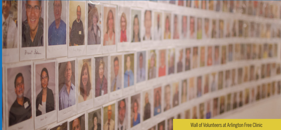
Wall of Volunteers at Arlington Free Clinic